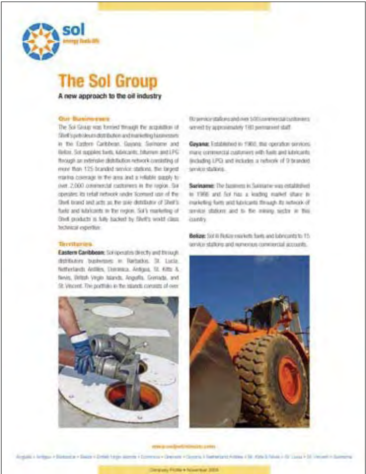
The Sol Group Design of presentation folder for multinational oil corporation, including design and copy editing of corporate press information kit and presentation CD with sleeve.