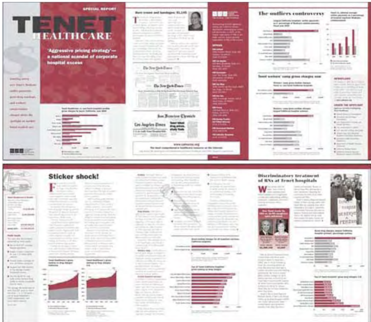
CNA Design and layout of tri-fold, 2-color brochure